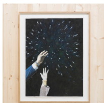
Tarje Eikanger Gullaksen Two Hands for the Stakes, Four-fingers for the Shakes | 2018 Gouache on Arches paper (308g) 57,5 x 76,5 cm the picture 67,5 x 86,5 w/frame