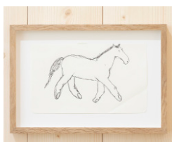
Tarje Eikanger Gullaksen Study for an Equestrian Statue | 2018 Pen on paper 21 x 12,6 cm