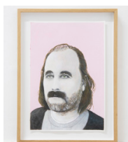
Tarje Eikanger Gullaksen Alt Mitt Er Ditt ! / What's Mine Is Yours! | 2016 Gouache on 308g Arches paper 25 x 36 cm