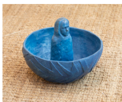
Tarje Eikanger Gullaksen Ideal Mistress Is Glass Glassy | 2018 Bronze with blue patina 21 x 21 x 16 cm Ed. 3+1