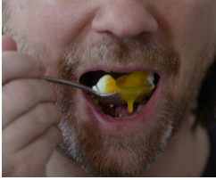
Tarje Eikanger Gullaksen Spoon to Spoon | 2019 Video 4K 7 min. approx