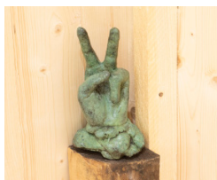
Tarje Eikanger Gullaksen Future!...or or and Mutation | 2019 Bronze with green patina 20 x 10 cm approx. Ed. 3+1