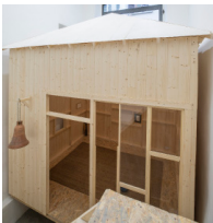
Marius Engh Le Tripode | 2019 Wooden boards, beams and sheets, nails and screws 458 x 367 x 333 cm